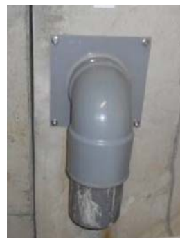
Figure 2: Joint drainage hole

(example of shape that enables measurement at each hole)